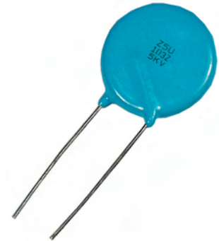
Epoxy Coated : High Voltage ( 2000VDC - 15,000VDC )