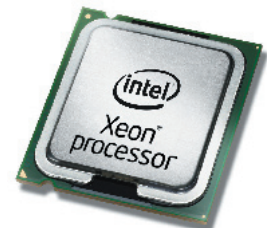
XEON is trademark and property of Intel USA